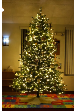
Decorating the sanctuary for Christmas