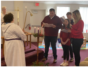
Advent worship with the lighting of the Advent wreath